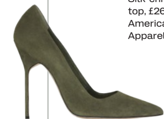
Suede shoes, £440, Manolo Blahnik