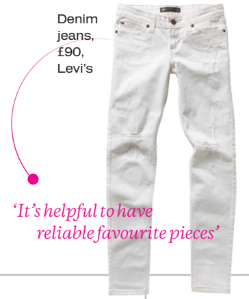
Denim jeans, £90, Levi's 'It's helpful to have reliable favourite pieces'

Warm yellow is great for meetings: it makes you look approachable, so people are more relaxed and receptive. I don't plan my outfits in advance, as I prefer choosing on the day; however, my clothes are organised by length on a rail in my bedroom. It goes from shorts and skirts