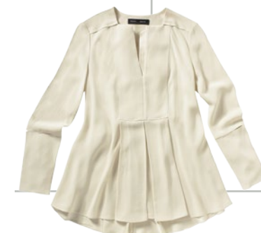
Satin-crepe top, £630, Proenza Schouler at Browns