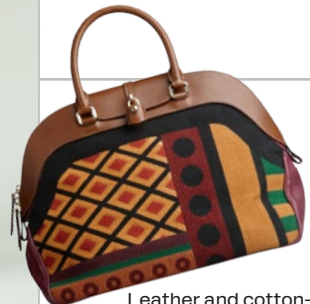
Leather and cotton-canvas bag, £1,595, Burberry Prorsum