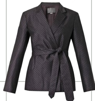
Clockwise from above: Wool-mix jacket, £710, Alexander Wang at Matches. Leather boots, £420, Robert Clergerie. Nylon skirt, £175, L.K.Bennett