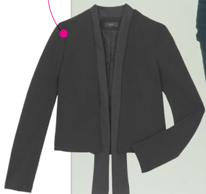
Velvet shoes, £425, Jimmy Choo. Fumei shirt, jeans and belt, all Chloe's own. Above: Silk-crepe jacket, £360, Joseph

'I dress to show authority but remain feminine'