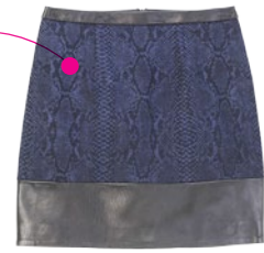
Denim and faux-leather skirt, £455, Christopher Kane at Browns

'On Sundays, I put together outfits for the week ahead'