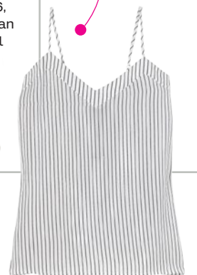
Silk-chiffon top, £26, American Apparel