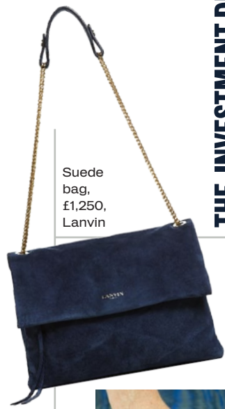
Suede bag, £1,250, Lanvin