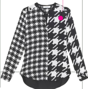
Silk top, £209, Sandro

Clergerie for shoes. I'm not a brilliant shopper, so I buy most of my pieces online and stock up on essentials.