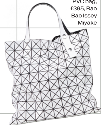
PVC bag, £395, Bao Bao Issey Miyake

bedroom is where I keep all my jeans and casual wear; my suits are kept in my office next door; and I have a third room with all of my shoes, blouses and skirts. Everything is colour-coordinated: white at the front, then black, and colourful pieces in another pile, making getting ready in the morning a lot more convenient. I want to feel empowered and elegant, so I would never wear something too extravagant, but I do wear heels most of the time, as well as minimalist Venyx World jewellery. I don't want to hide my femininity. >