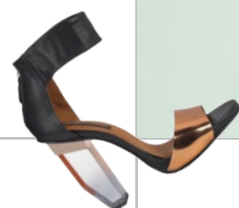
Leather and Plexiglas shoes, £200, Miista