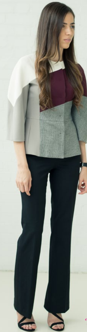
ELENI ANTONIADOU MEDICAL RESEARCHER / CEO OF MEDICAL AND BIOTECH COMPANY TRANSPLANTS WITHOUT DONORS